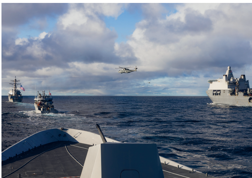
Military mobility in practice – a snapshot from the Nordic Response 24 exercise.

The cooperation within Nordic capability development took substantial steps forward during the past year, following the progress with Finland's and Sweden's applications to NATO. Three priorities were launched in 2023: firstly, to promote Nordic defence capability cooperation in relation to NATO processes, such as the NATO Defence Planning Process (NDPP); secondly, to review ongoing capability formats and projects in NORDEFECO; and thirdly, to promote work that improves the capability to receive and move military units and formations within our region. This will build upon and complement ongoing work on improving military mobility.