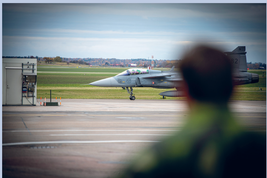
JAS 39 Gripen at Uppland Wing, Ärna Airbase in Sweden.

In a NATO context, the Nordic defence cooperation will, through the renewed level of ambition and more operational focus, ease the burden for the whole region and simultaneously contribute to the deterrence and defence of the Euro-Atlantic Area. Joint Nordic operational planning will highlight joint capability needs and bring about incentives for