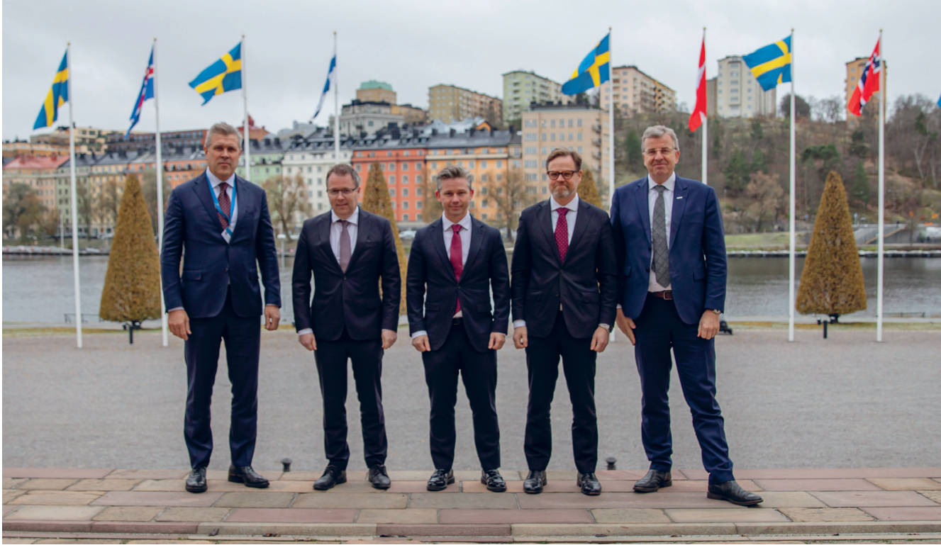
The NORDEFCO defence ministers' meeting in Stockholm, Sweden in November 2023.