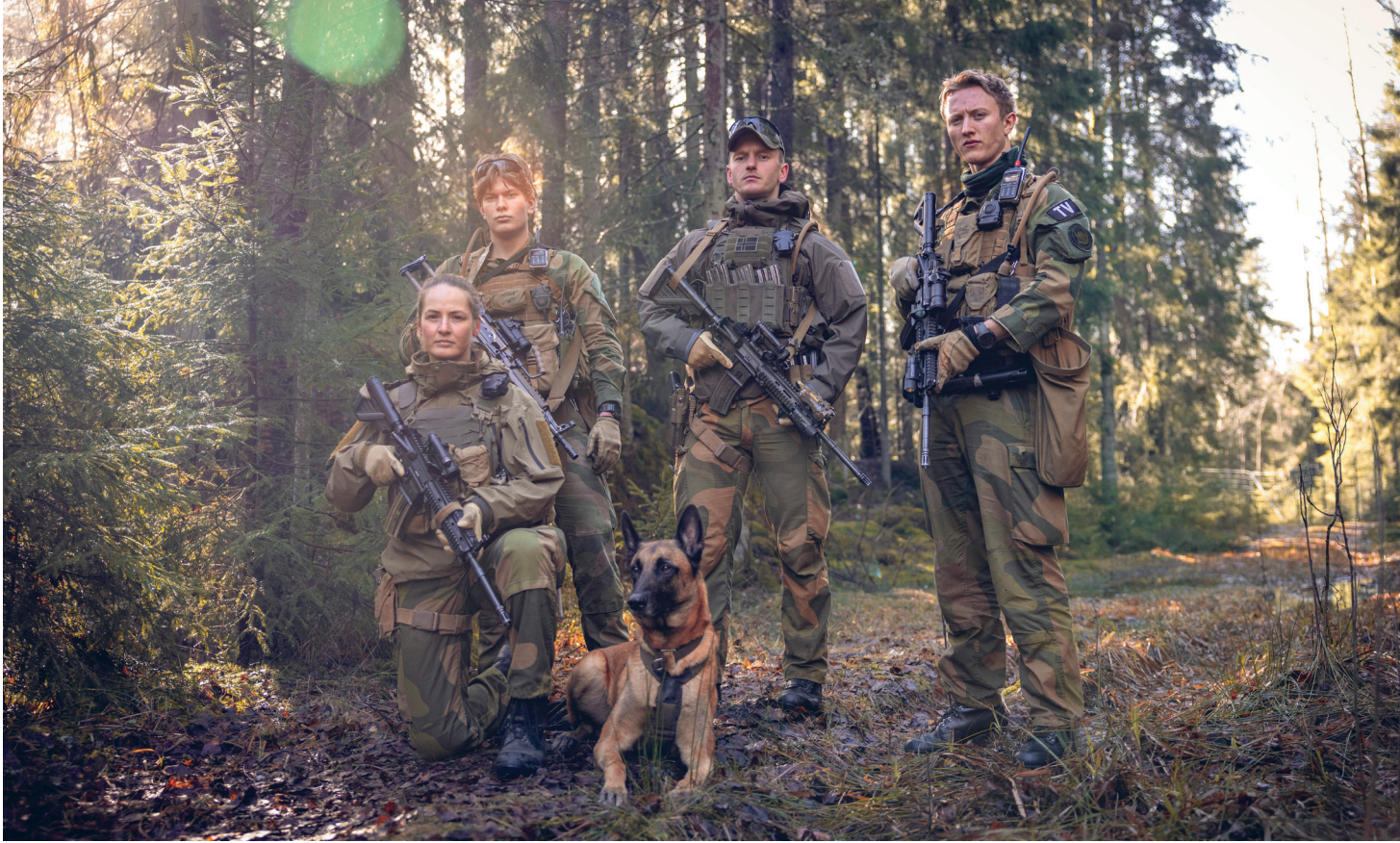
Soldiers during the Nordic Response 24 exercise.