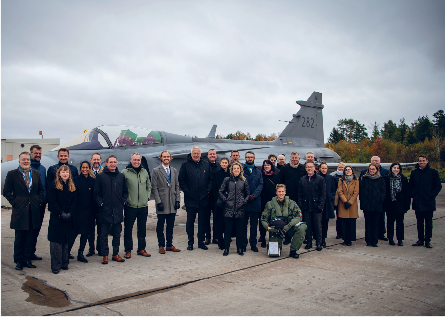
Political Steering Committee meeting at Uppsala Wing, Årna Air Base, in October 2023.